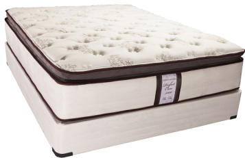
A GOOD BED