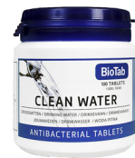
CLEAN WATER OR CLEANING TABLETS