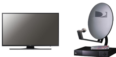
TELEVISION, SATELLITE DISH