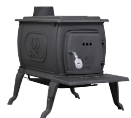
WOOD BURNING STOVE