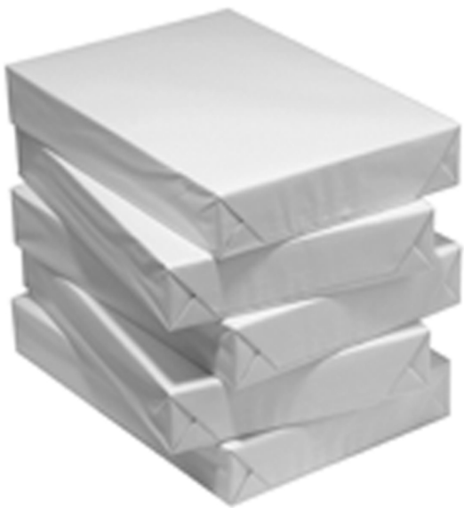
LOTS OF PAPER