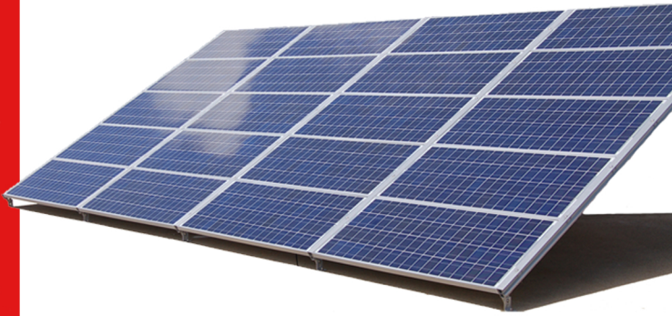
SOLAR ELECTRIC PANEL