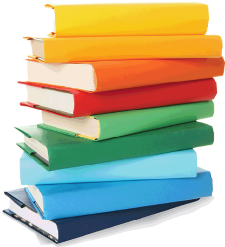
LIBRARY OF BOOKS