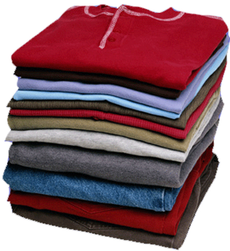
FULL SET OF CLOTHES