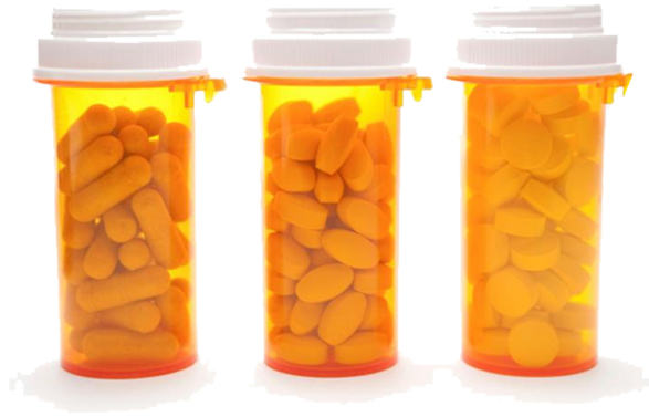
CHEST OF MEDICINES