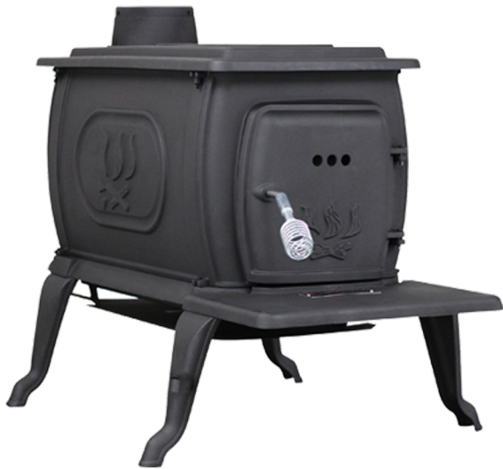
WOOD BURNING STOVE